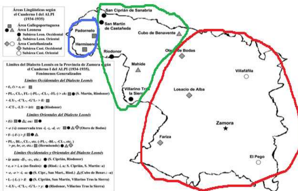
Figure 2. The three dialectal areas of Zamora province according to González Ferrero (2007: 200).

González Ferrero's (2007) study establishes the boundaries of the Leonese dialect in the province of Zamora at the beginning of the twentieth century and the different areas and subareas by using data from the ALPI Cuaderno I questionnaire. An in-depth analysis of each of the thirteen phonetic features chosen by this author and the comparison of his results with other previous studies allows González Ferrero to create a map with the precise limits of the Leonese dialect and to identify three different dialectal areas in the province. Figure 2 shows these three areas: Galician-Portuguese (in blue), Leonese (in green) and Castilian (in red).