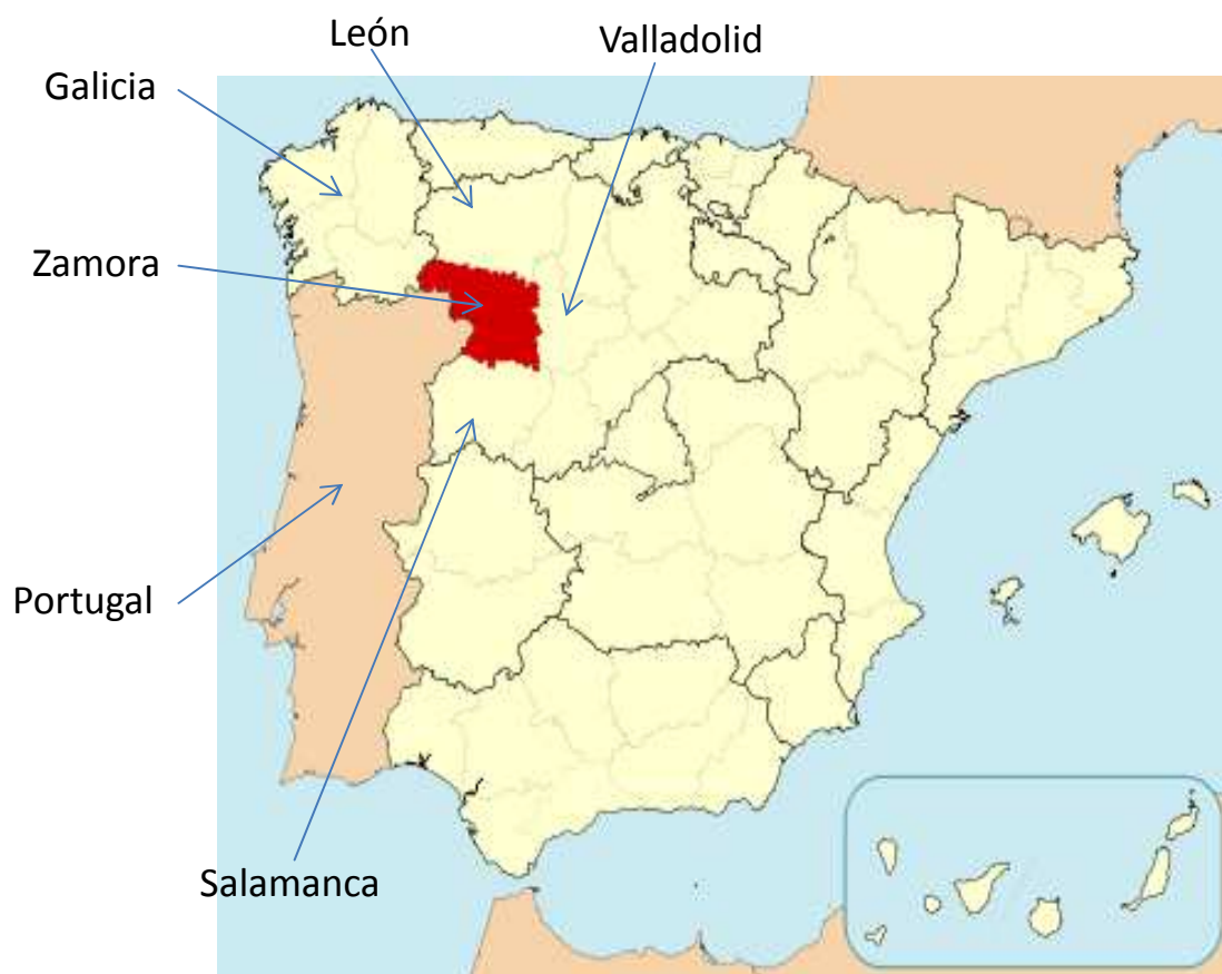
Figure 1. Zamora 4

Zamora province is located in the Northwest of Spain and belongs to the autonomous region of Castilla and León. This province borders with León province to the North, with Valladolid province to the East, with Salamanca province to the South, with Portugal to the West and with Orense (province Galicia) to the Northwest. It is this location between the province of León with its own dialect (Leonese), Galicia and Portugal with their own languages (Galician and Portuguese) and the two Castilian provinces of Salamanca and Valladolid that makes of Zamora an ideal place for dialectology and language contact research.